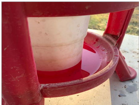
1. Kubic water tank.