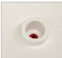
2. Water tank with the Flow Valve inserted correctly.