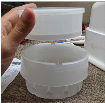
4. Float inside the float housing.

This step is usually missed and will result in water inside the trough, but not much.