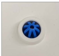
3. This is how the float should be placed into the float housing.