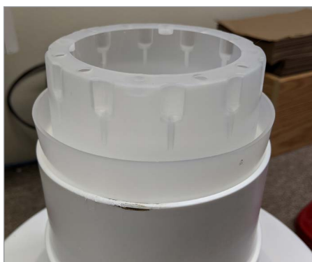
6. Float housing pressed down into the water tank.

This step is usually missed and will result in water inside the trough, but not much.