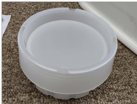
5. Float housing inside the bottom of the water tank.